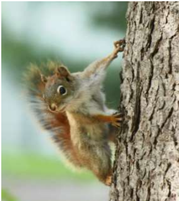
Red Squirrel, one of the many animals who cherish acorns.

Mammals, Birds & Acorns: These forests provide, via acorns and hickory nuts, important food stuffs for an array of wildlife. Among the larger resident mammals eating these nuts are White-tailed Deer, Black Bear, and Red and Grey Fox. Added to this are many rodents – Grey, Red and Flying Squirrel, Eastern Chipmunk and White-footed Mouse, for example – and a surprising number of birds including Turkey, Blue Jay, Nuthatch, Brown Thrasher and Rufous-sided Towhee. During summer, the spacious bark of Shagbark Hickory can provide bat day roosts and, at least elsewhere, the endangered Indiana Bat is thought to use such forests.