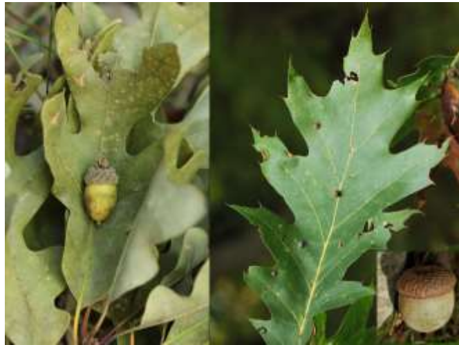
The acorn and leaf of a White Oak (left) and Red Oak (right). The small buttons on the Red Oak leaf are leaf galls.

exist throughout the County. Oak-Hickory Forest tends to occur in dry microclimates and tolerates summer heat as well as harsh conditions in winter.