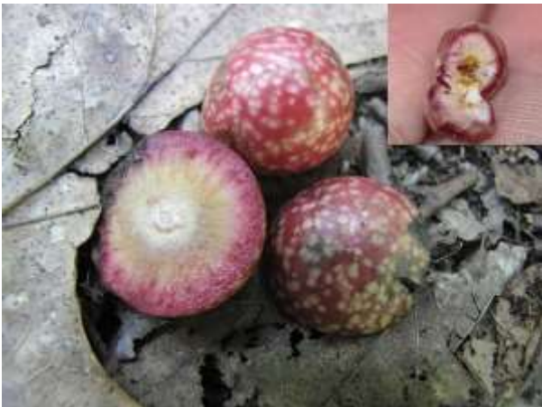
These are Acorn Plum Galls, formed when a gall wasp lays its eggs near the base of a developing Red Oak-group acorn; the inset shows the light, spongy interior surrounding the dark home of the gall wasp larva.

None of our ground beetles or ants were confined to this forest type. However, Pterostichus tristis and Pterostichus adoxus were almost twice as common in the Oak-Hickory Forest as in the remaining forests. Both of these are caterpillar eaters, and perhaps taking advantage of the abundance of moths. The ants of Oak-Hickory Forests seem to be a relatively standardized set of forest species. Interestingly, although several species of ant (of the genus Temnothorax ) nest inside of hollow acorns, but they were no more common in nominate Oak-Hickory Forest than in other forest types, perhaps because of Red Oak’s occurrence across many forest types.